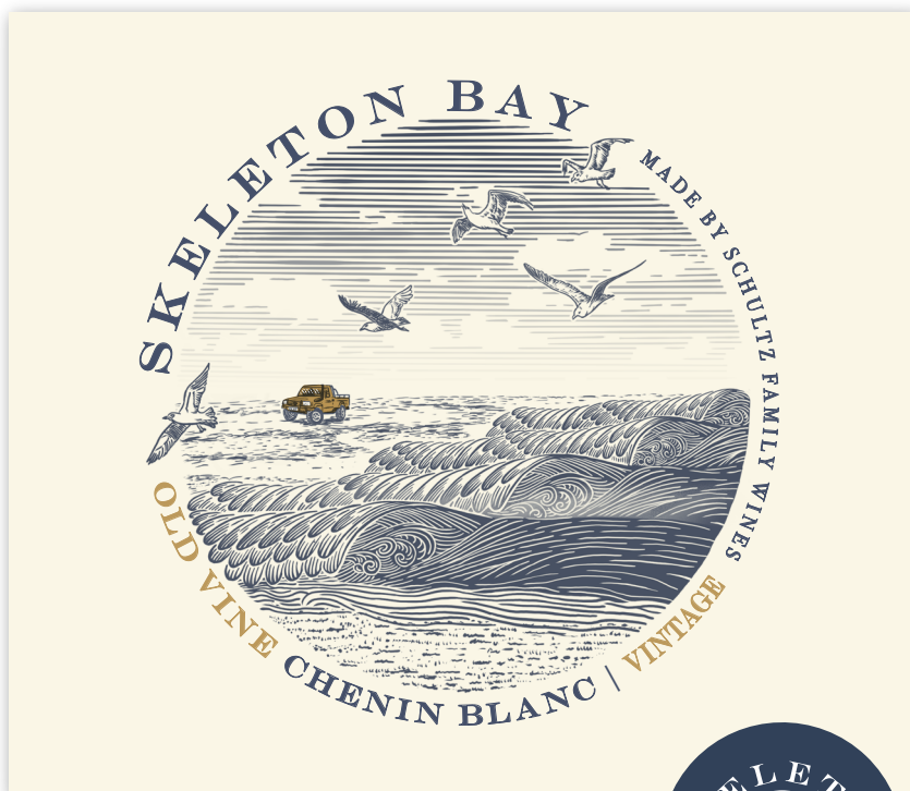
ACTUAL SIZE LABELS